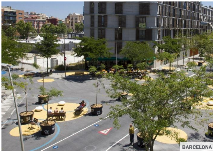
Barcelona Superblocks Initiative