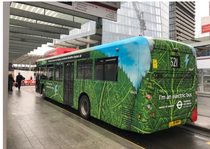
London Electric Buses