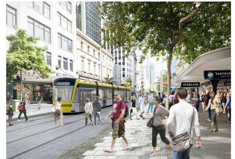
Auckland Access for Everyone