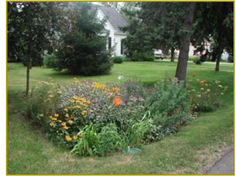
Rain Garden, Courtesy Maplewood Public Utilities